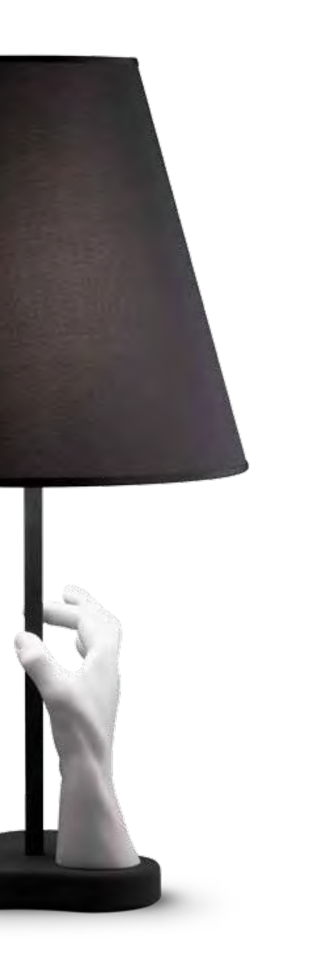
Table lamp with dimmer. Base of marble powder and resin and square section stem in metal, both painted "soft" black matte. Hand in white marble powder and resin. Diffuser in black fabric lined with white PVC.