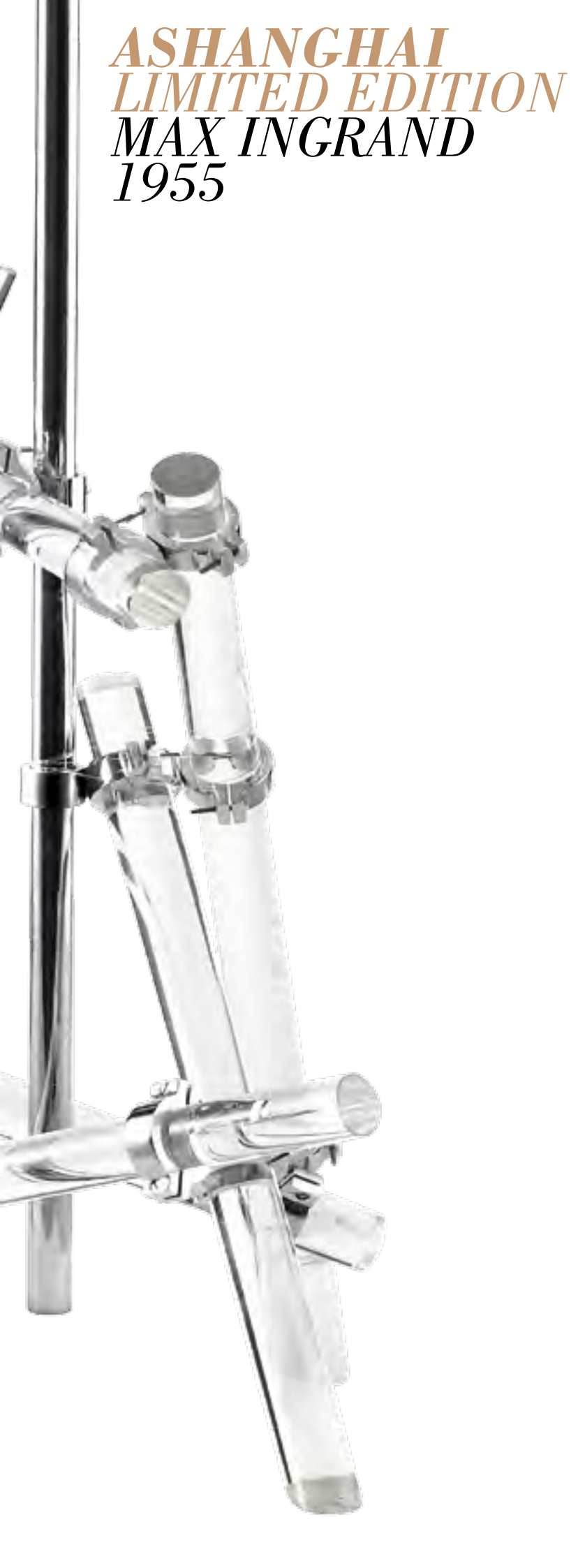
Table lamp with dimmer. Frame in chrome-plated brass. Main diffuser in white acid-etched cased blown glass. Top of diffuser in float glass sheet sandblasted on both sides. Base made from transparent borosilicate glass. Fixing points in chrome-plated brass.