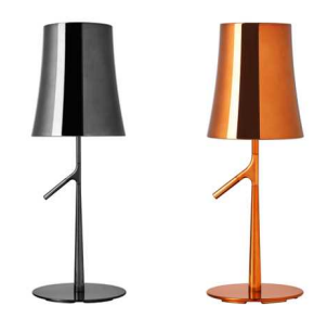
Brightness light diffused light