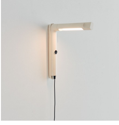
SIPTEL Wall Lamp