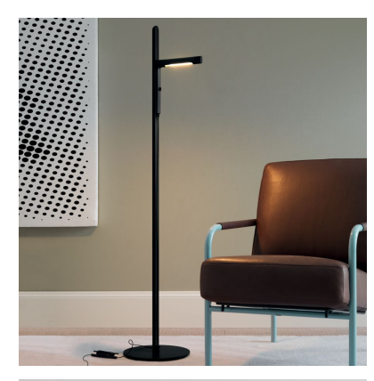
SIPTEL Floor Lamp